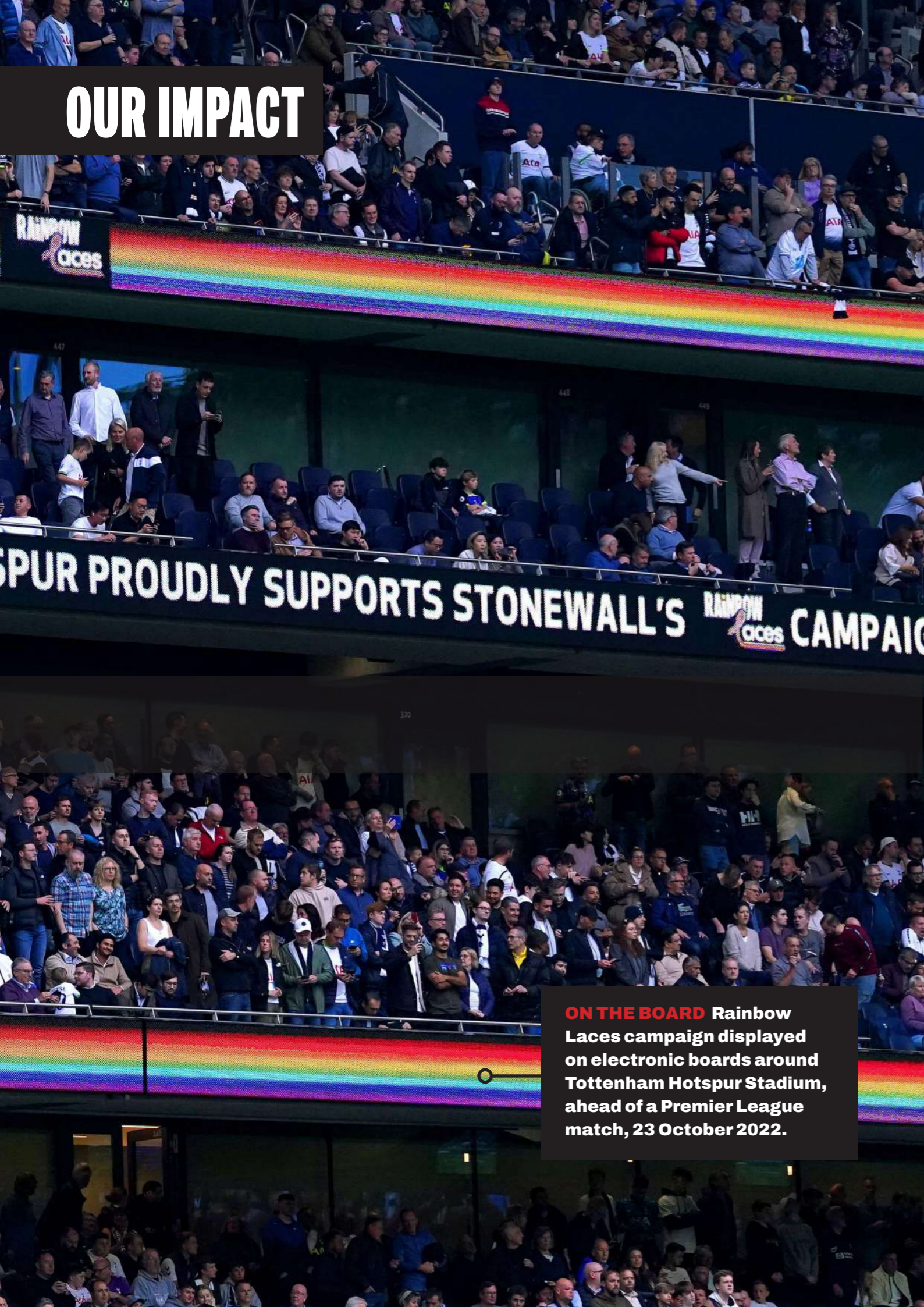
ON THE BOARD Rainbow Laces campaign displayed on electronic boards around Tottenham Hotspur Stadium, ahead of a Premier League match, 23 October 2022.